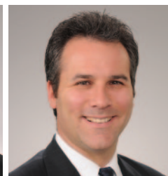
David M. Cohen Real Estate